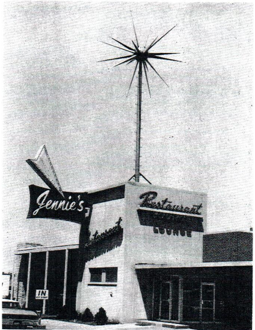
A CHICAGO RESTAURANT adds impact to its location with the spider-like movements of a neonized "sputnik" display.